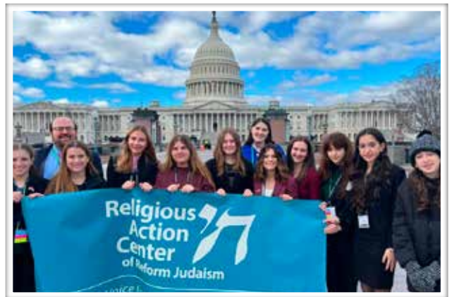
In January, several of our SchZFTY teens traveled to Washington D.C. for L'Taken - the Religious Action Center's Social Justice Seminar.