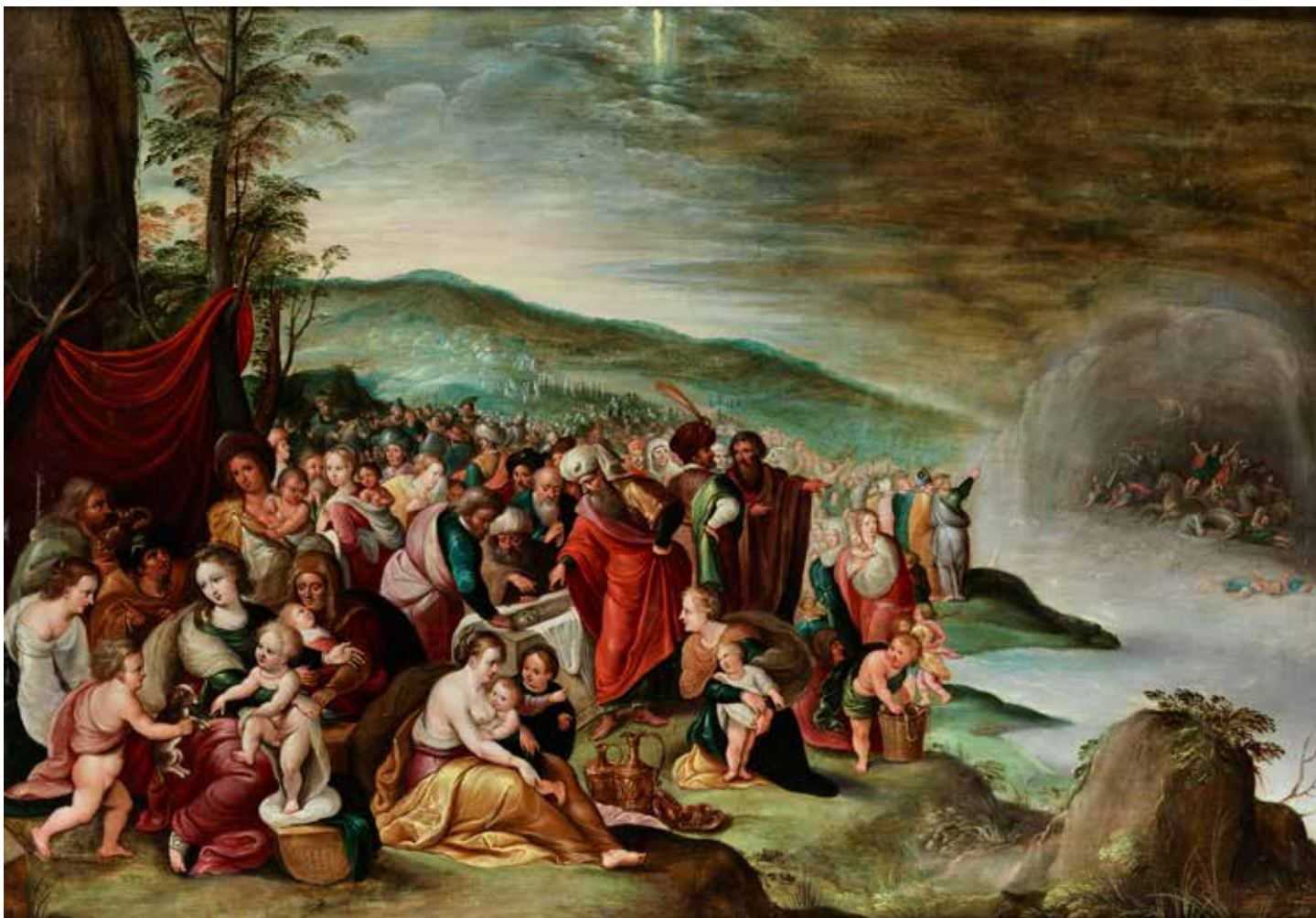
Moses parting the Red Sea, Vincent Malo (I), Public domain, via Wikimedia Commons