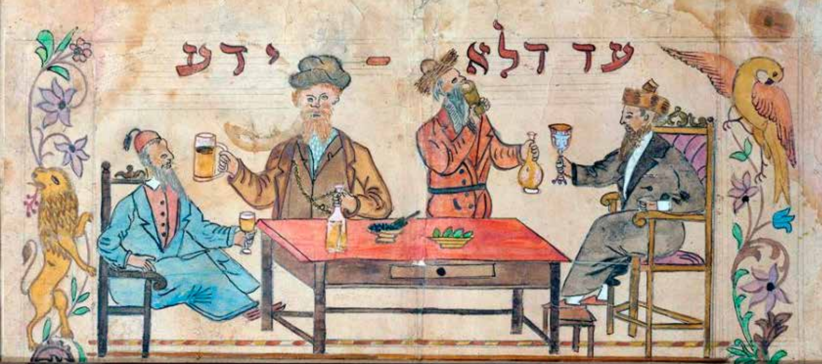
Purim painting, untitled. Safed, Israel, 19th century. Hasidic Jews celebrating Purim with a Sephardic Jew (left). The inscription is part of a passage from the Talmud urging Jews to imbibe enough alcohol so that they will not know the difference between the phrases “cursed is Haman” and “blessed is Mordechai.” Collection of Isaac Einhorn, Tel Aviv.