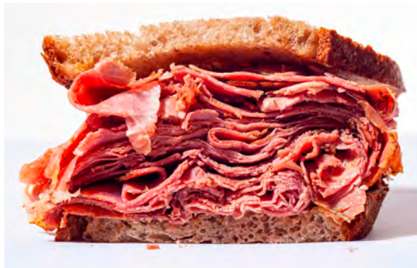
Deli Nite is back! Mark your calendars for Saturday, March 12.