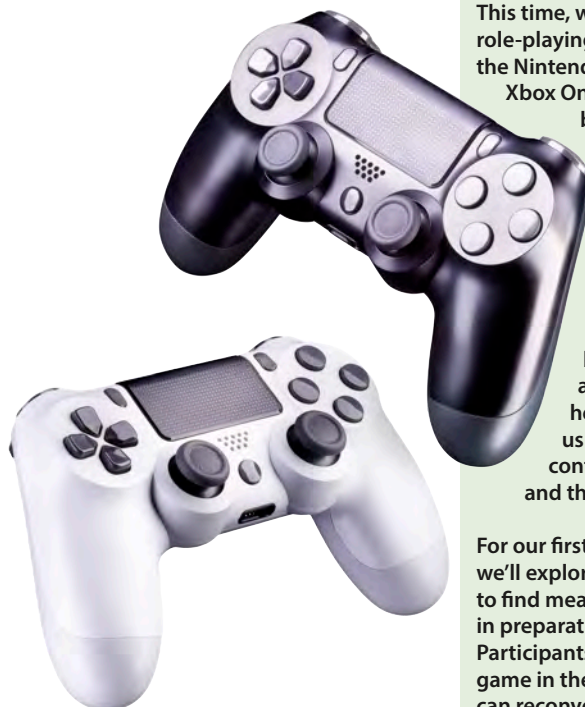
Even in battle, respecting boundaries is important in the Undertale universe.

Whether you have lots of experience with games or very little, join me in what I know will be exciting new Schaarai Zedek programs! Game on! ●