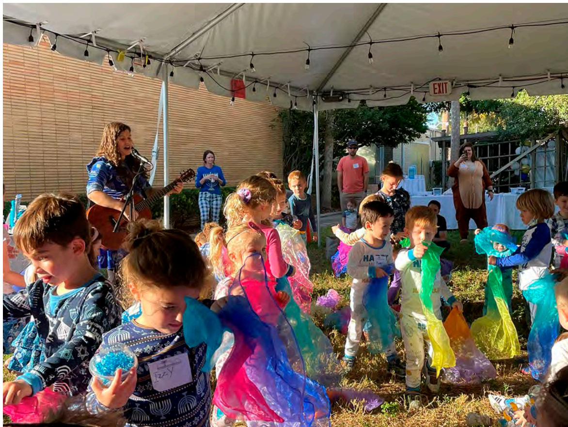
Gathered under our new tent, our Families with Young Children celebrated Chanukah with a fabulous pajama party on December 5!